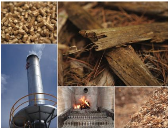
Inspiring energy efficiency - advancing renewable energy

Guidance for local authorities PM 10 emissions from wood fuels